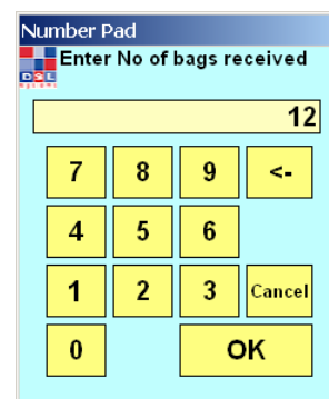
Enter the number of bags

The AutoPilot4Feed Hand Held with barcode reader improves quality by preventing mistakes and reduces paperwork.